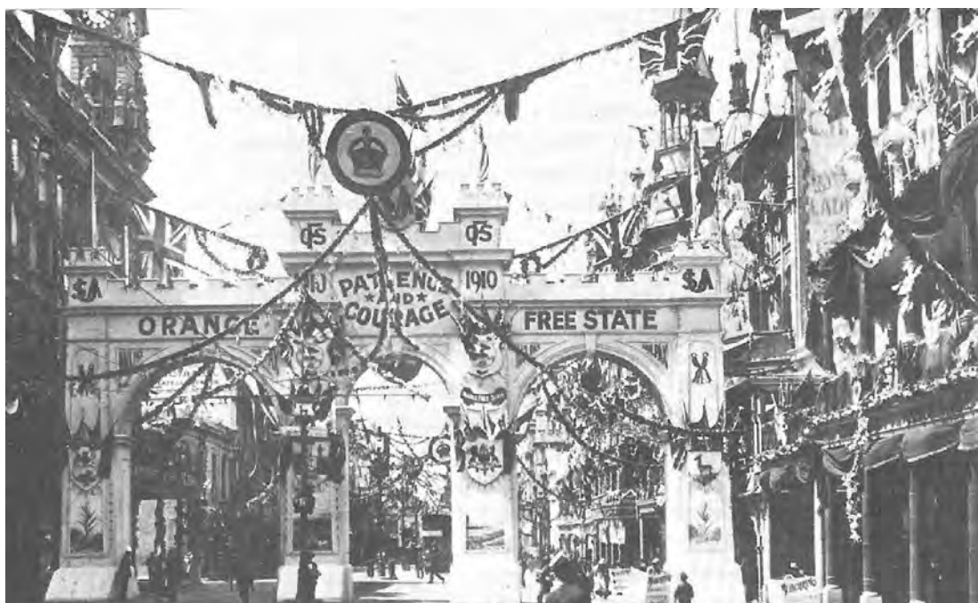
A photograph showing celebrations in South Africa on the creation of the Union, 1910.

17 Study the photograph, and then answer the questions which follow.