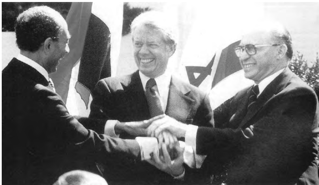
President Carter, President Sadat and Prime Minister Begin after signing a peace treaty in March 1979.

20 Study the photograph, and then answer the questions which follow.