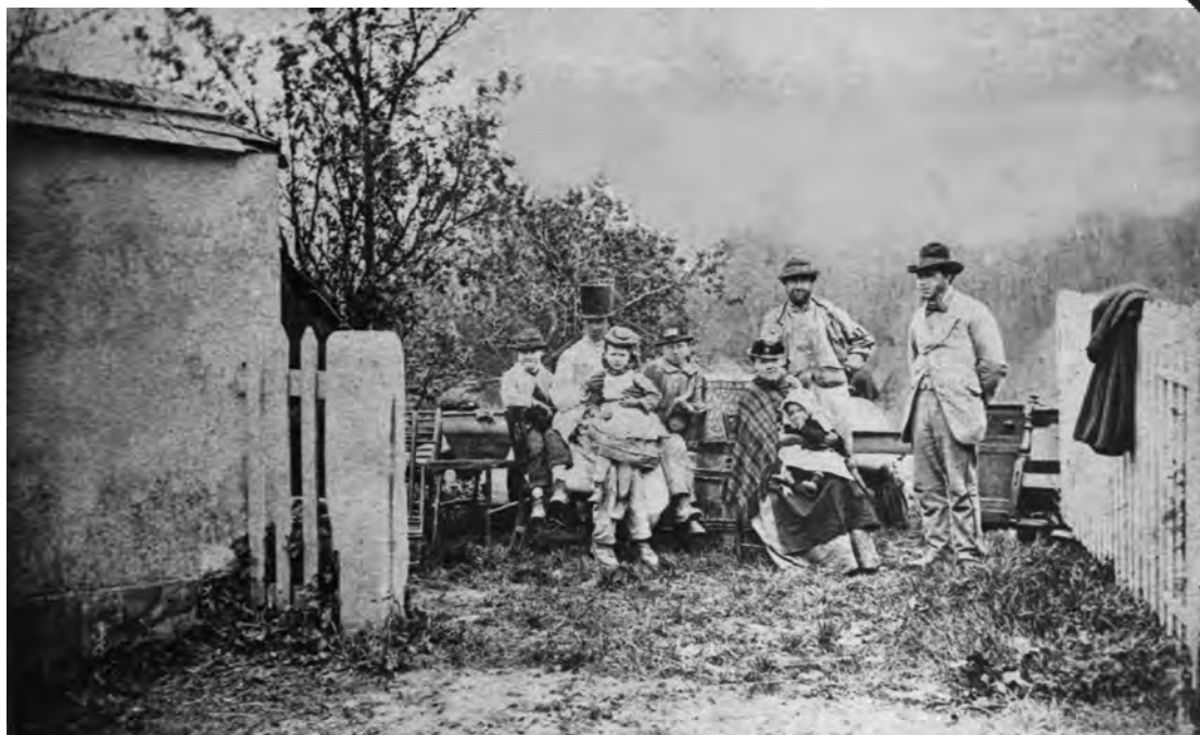
Farm labourers evicted from their home for being members of the National Agricultural Labourers' Union, 1874.

23 Study the picture, and then answer the questions which follow.