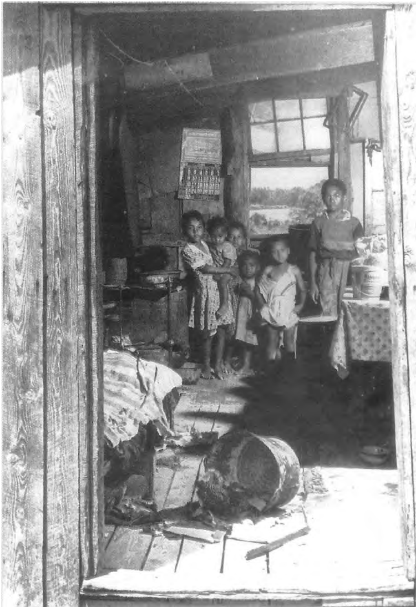
A family home in the Southern state of Virginia.

13 Study the illustration, and then answer the questions which follow.